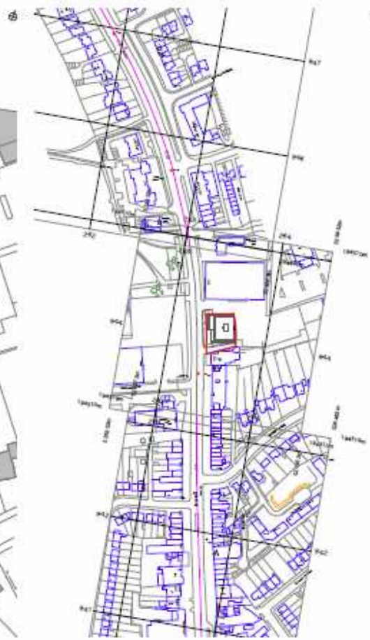
Site Location Plan 1:1250